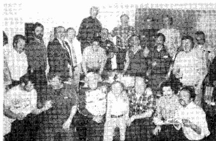
Christmas Time at Westinghouse