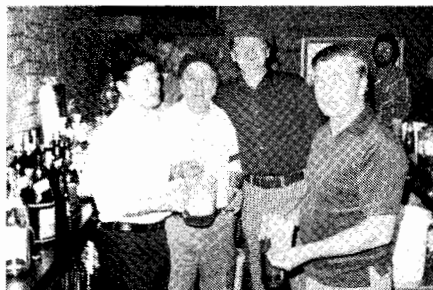
The Mixologists of the Armor Party