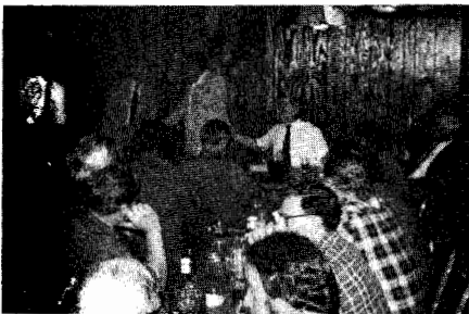
The Otis Jamaica men having a meeting.