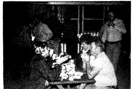
Long Island men enjoying food and drink and alot of conversation.