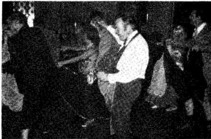
The exotic dancers trying to teach elevator men how to dance.